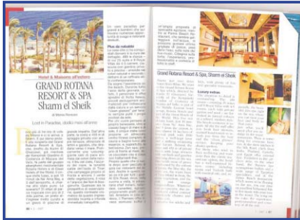
GRAND ROTANA RESORT & SPA Sharm El Sheik