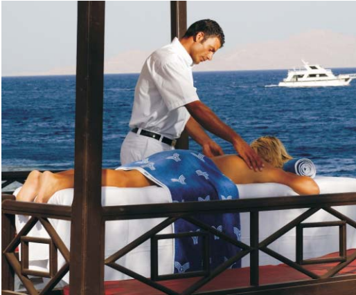
Holistic Therapies from around the world