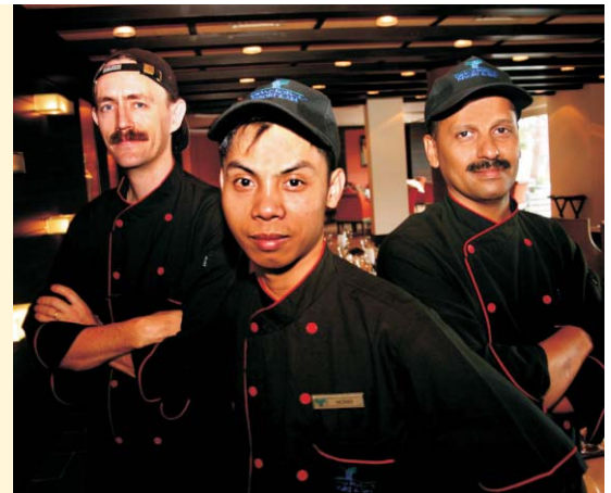
3 Chefs, 3 show kitchens, 1 Silk Road

Silk Road: Where eastern cooking compliments western cuisine, Silk Road is the signature restaurant of the Grand Rotana Resort & Spa with its 3 show kitchens featuring cuisines from China and Thailand passing by India and Arabia to Western Europe. Open from 7 until 11 pm