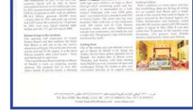
Tourists back at Sharm; new Rotana attracts