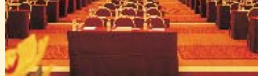
State of the art ballroom seating 500

full advantage of the destination and the resort.