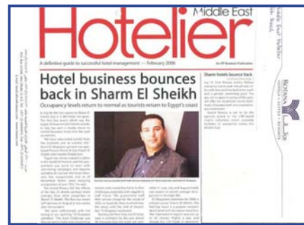
Hotel business bounces back in Sharm El Shaikh