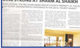
Going strong at Sharm Al Shaikh