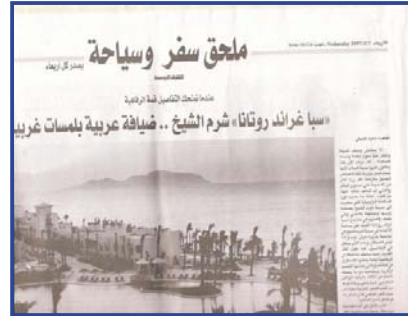
ضيافة عربية بلمسات غربية.. شرم الشيخ " سبا غراند روتانا"