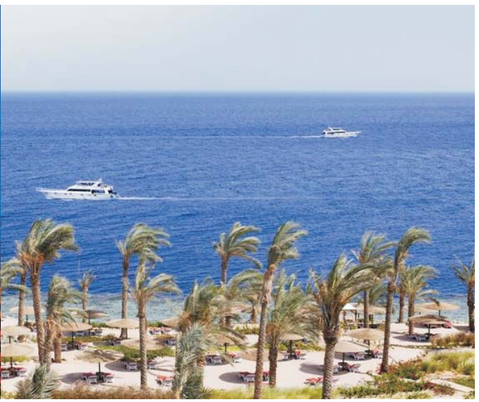
450 metre stretch private beach