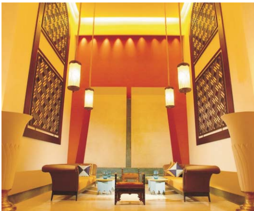
Sensitive Interior Design