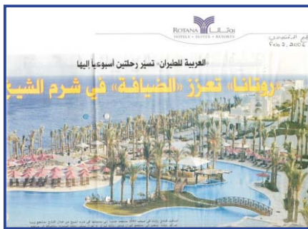
روتانا تعزز الضيافة في شرم الشيخ