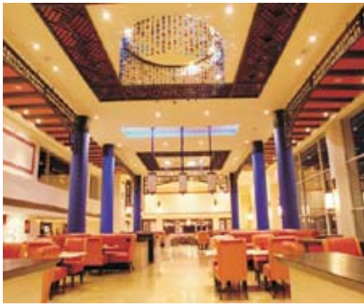
Colourful and cosy Grand Lobby Lounge

Isis: Amidst the stunning decoration of the Grand Lobby is a colourful & cosy lounge where you can relax and unwind while sampling a fine selection of single malt whiskey or Cuban cigars. In addition, Isis offers light snacks and a variety of coffees. Open from 10 am until 12 midnight