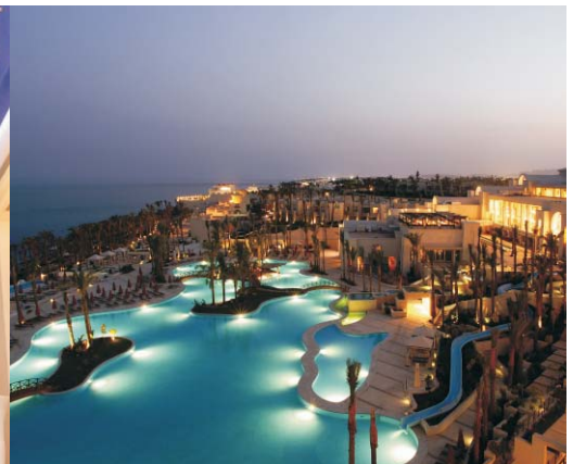
Sustainability and Regenerative Design