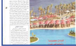
فنادق مجموعة روتانا في شرم الشيخ