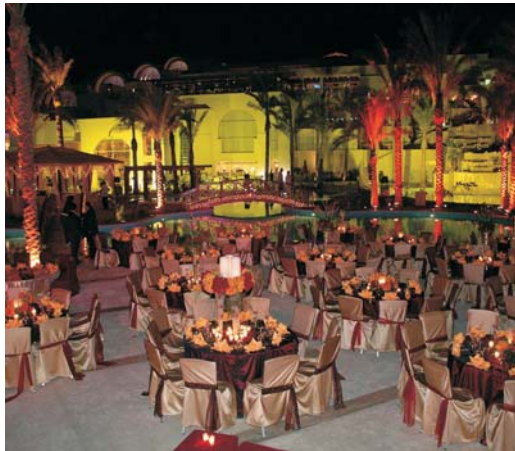
Grand Indian Wedding