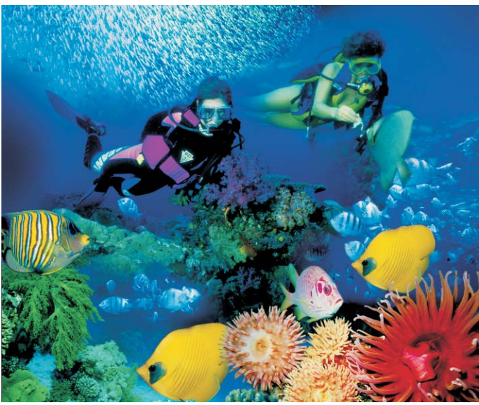
The Red Sea: arguably the best diving and snorkeling in the world