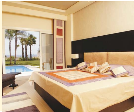
Villa bedroom view of lush tropical landscape