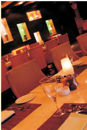
Silk Road Restaurant

Sky Lounge: A magical majlis that features a selection of shishas, Arabic teas and flavored vodkas, complimented by of Oriental mezzeh and hot snacks that are served late into the night. Open from 3pm until 1am